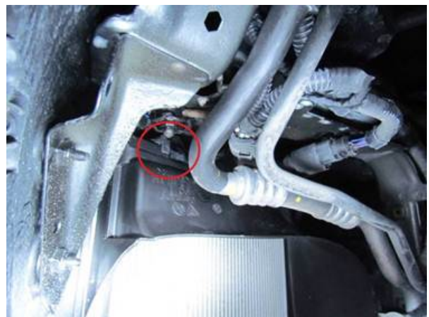
Figure 10. View of exit air duct affixed to mounting hook.