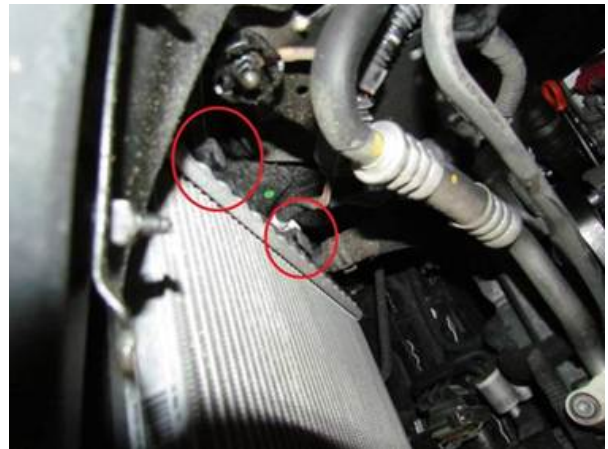
Figure 8. Upper exit air duct attachment points to charge a cooler.