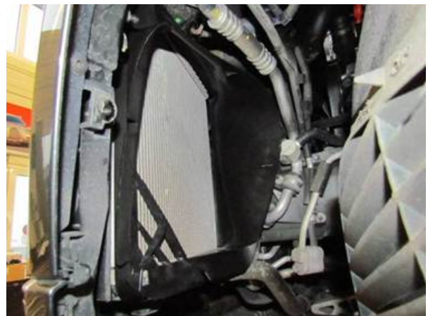
Figure 9. Charge air cooler exit air duct installed.