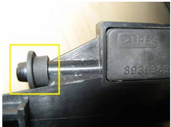
Figure 5. Ring seal installed on headlamp air tube.

4. Install ring seal on headlamp air ventilation tube (Figure 5). The larger diameter of the seal faces the headlamp.