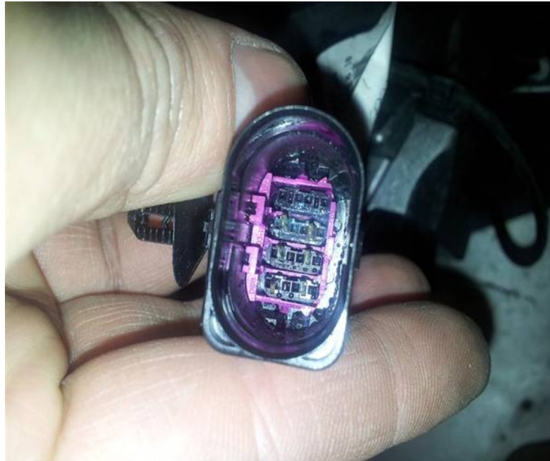
Figure 1. Water ingress on front bumper harness connector.

Tip: Replace the seals around each contact that is repaired to prevent water from entering the plug again.