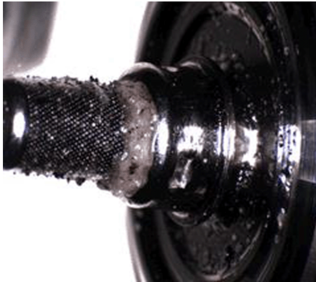
Fuel Pressure Regulator 2 With Rust (On Left) Due To Water Contamination