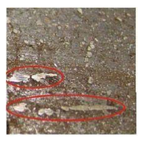
Figure 1. Metallic deposits.