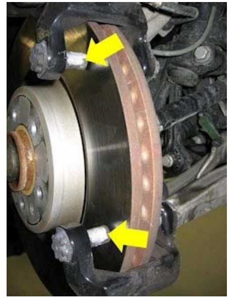
Figure 5. Caliper carrier guide pins with anti-seize (G 052560A2) lubricant applied where the pads make contact.

2. Apply a thin coat of anti-seize (G 052560A2) lubricant to the guide pins of the caliper carrier prior to installing the brake pads (Figure 5). Only apply this lubricant to the section of the guide pins that will be contacted by the brake pads.