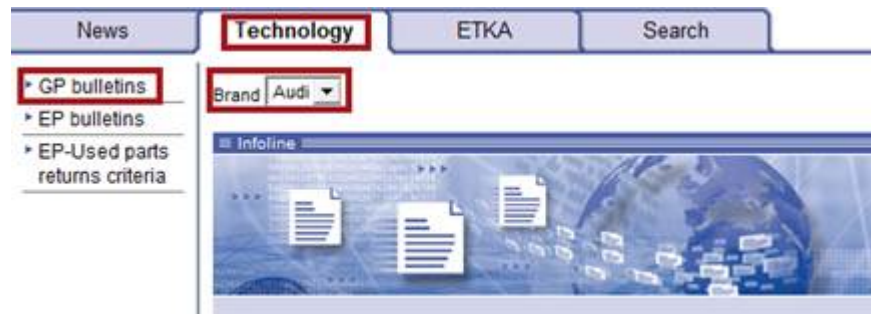
Figure 4. Selections to be made in INFOLINE.