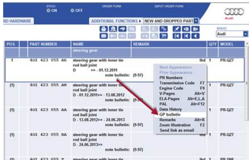
Figure 1. Right-click on one of the steering gear entries to open the shortcut menu.