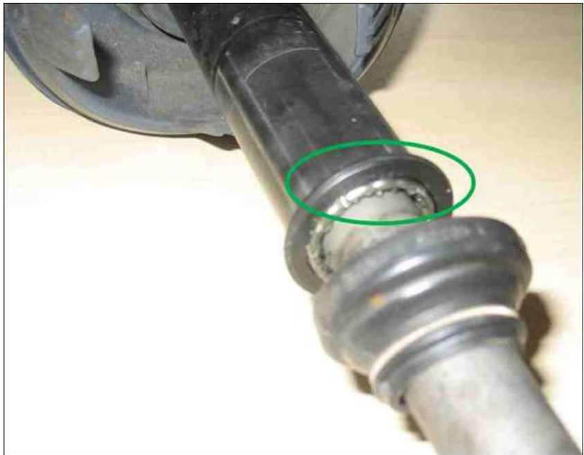
Figure 2. A correctly-fitted sleeve that is flush with the metal pipe. (The cap has been removed for this picture.)