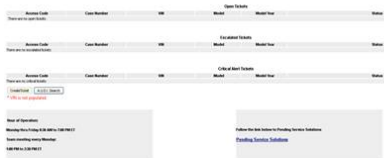
Figure 2. Technical Assistance page

For payment processing, Guided Fault Finding Logs must be documented identifying that the applicable fault codes were present and have been cleared. All claims are subject for review.