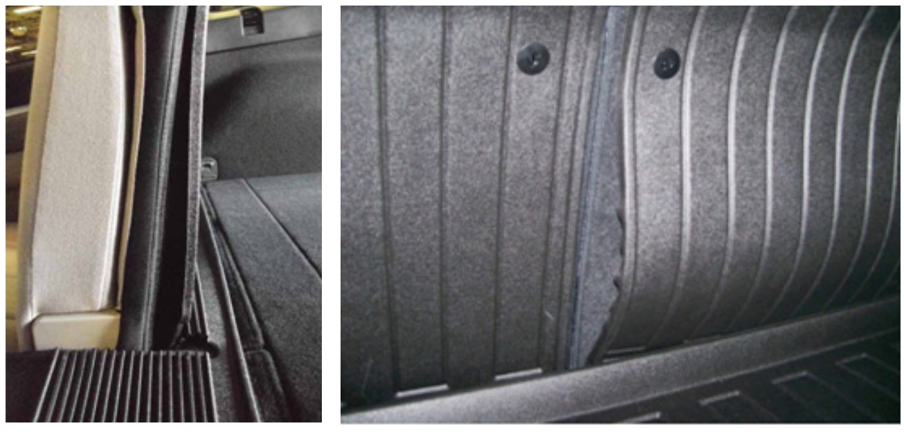
Typical seat back protector fit

If the seat back protector buckles outward from the rear seat back excessively, please make sure the seat back protector is installed properly. A seat back protector that is installed too low on the rear seat back will interfere with a bracket in between the cargo area floor and the rear seats. This interference causes the seat back protector to buckle when the seats are folded upright.