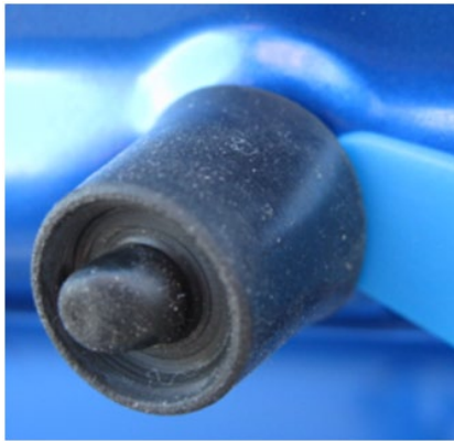
Release One Tang

To remove the trunk stopper, use a plastic trim tool to lift up and release one of the retaining tangs. Once you have one side released, hold the one side of the stopper away from the body then release the opposite tang with the plastic trim tool as shown in the photos below.