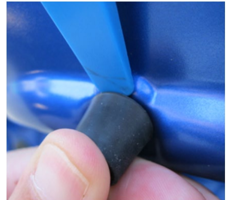
Hold Onto Stopper and Release the Opposite Side Tang

Grasp and pull up on the old weatherstrip to release and remove it from the trunk opening body flange. Leave any adhesive remaining on the flange in place to help secure the new weatherstrip.