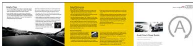
Figure 2. New Start-Stop glovebox insert.