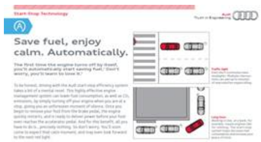
Figure 1. Old Start-Stop glovebox insert.

4. If available, replace the old Start-Stop glovebox insert (Figure 1), with the new glovebox insert BR-12-631-US (Figure 2). Additional inserts may be ordered from the Brand Store.