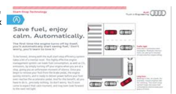
Figure 1. Old Start-Stop glovebox insert.

If available, replace the old Start-Stop glovebox insert (Figure 1), with the new glovebox insert BR-12-631-US (Figure 2). Additional inserts may be ordered from the Brand Store.