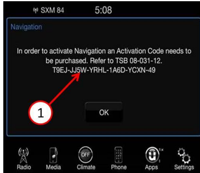
Fig. 1 Request code

NOTE: The person that calls in will need the program ID 40CD1, dealer code, VIN, their SID number and 22 digit request code. They will ask for your e-mail address, so they can send you a confirmation of the activation code. The call center is opened Monday - Friday, 9:00 am to 8:00 pm Eastern Standard time. To expedite, once the 22 digit code is retrieved from the vehicle, multiple vehicles can be activated during one phone call.