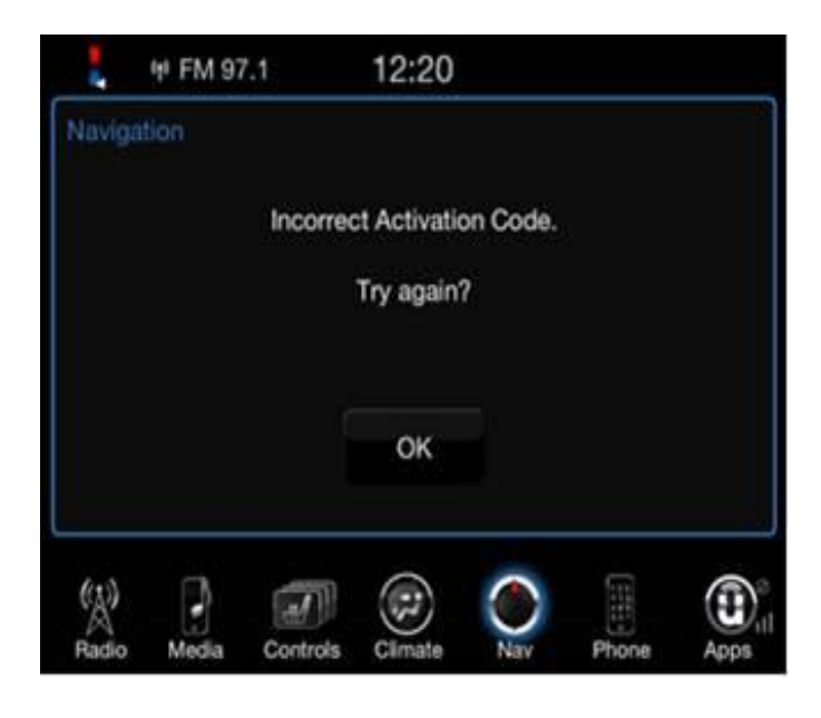
Fig. 5 Incorrect activation code was entered

8. If the access code was not properly copied or entered into the radio you will see this screen, (Fig. 5). If needed, start the procedure over again to enter the proper activation code.