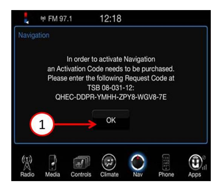
Fig. 3 To continue press OK

1 - Press "OK" to move to the next screen.