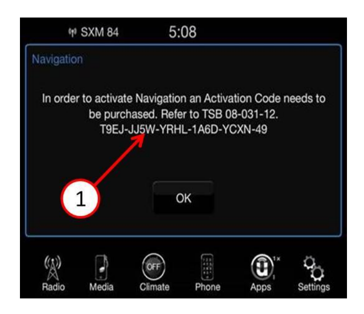
Fig. 2 Request code