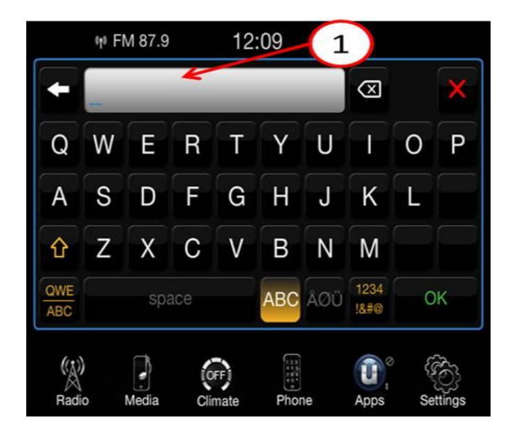
Fig. 4 Entering the VP3 code to activate navigation system

1 - Enter the Activation code in this space.