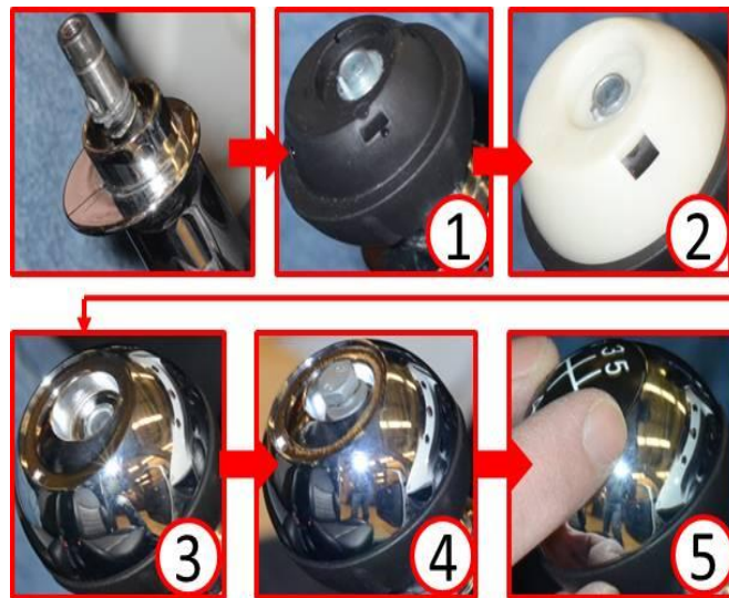
Fig. 3 Shift Knob Installation