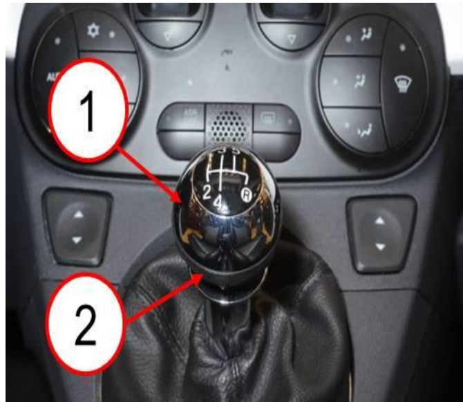
Fig. 1 Shift Knob