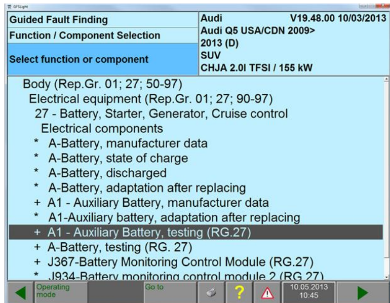
Figure 2. A1 Battery Test.