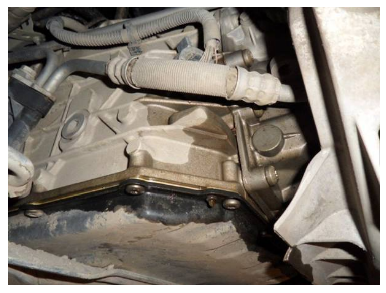
Figure 3. Leak between gearbox housing and intermediate housing.

Tip: The source of the leak may be confused with o-ring of drain plug.