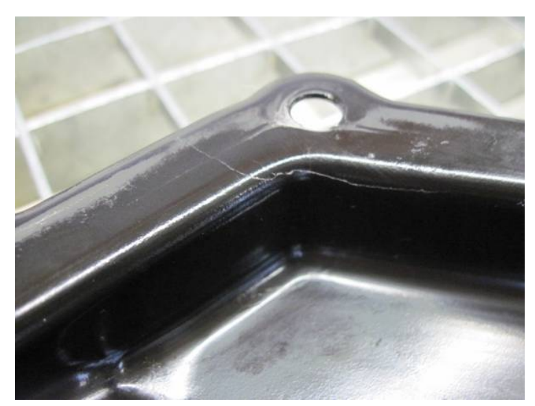
Figure 2. Crack in the oil pan.