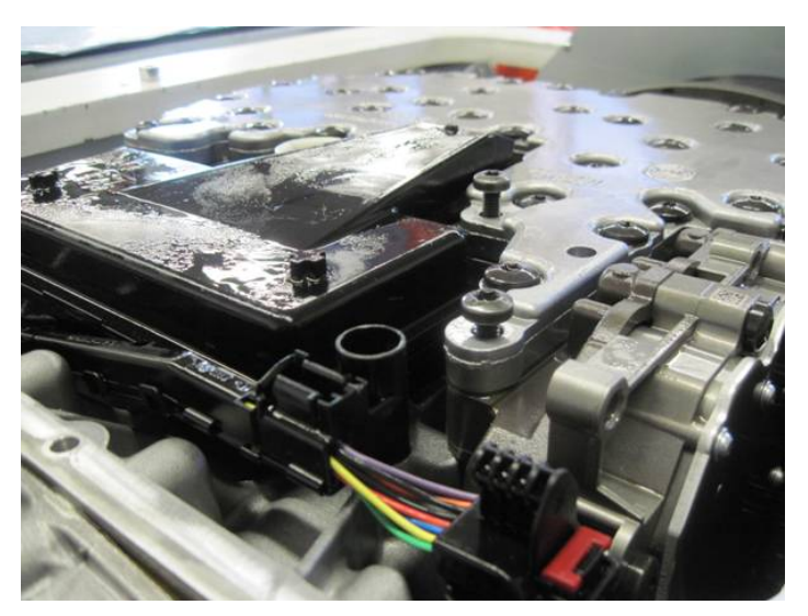
Figure 6. Loose bolts in the mechatronics.