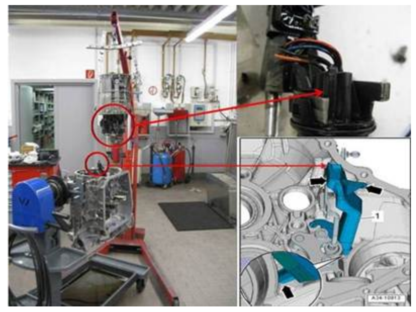
Figure 7. Caution points: drip tray Sensor module connector.

Tip: Use caution when lifting or lowering intermediate housing to avoid damage to components (Figure 7).