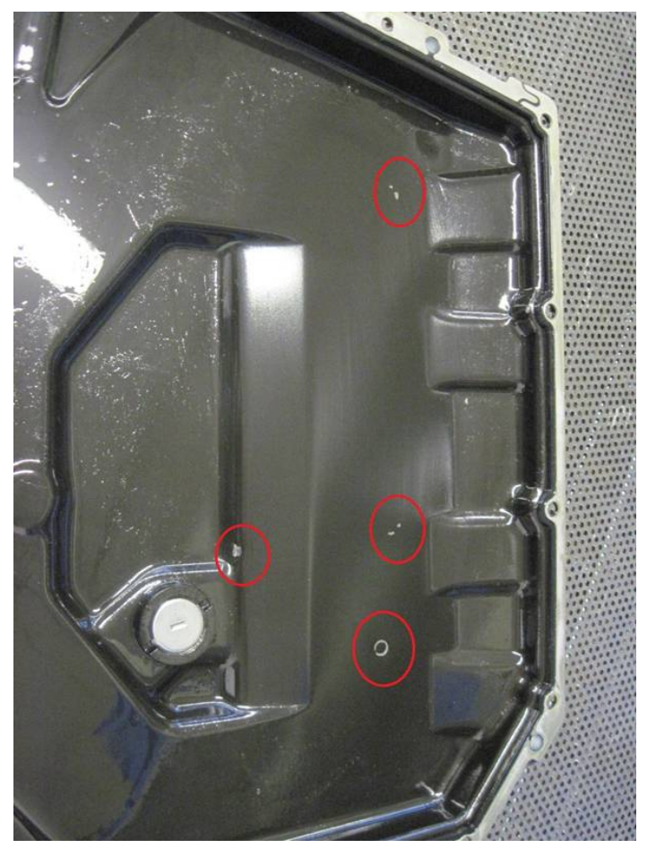
Figure 5. Damaged oil sump because of loose bolts.