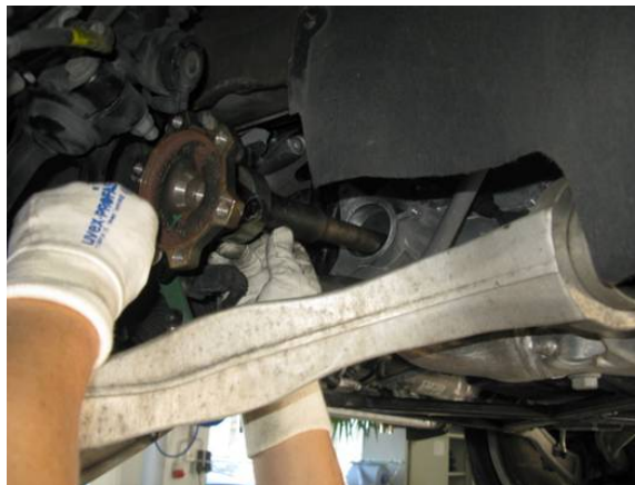
Figure 4. Supporting the flange shaft.

After a removal, the bolts must always be replaced by new parts (new part number: N 91208801 ).