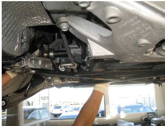
Figure 3. Pulling out the flange shaft.