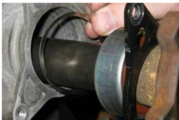
Figure 10. Position of shims.