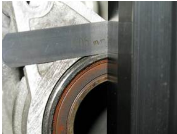
Figure 5. Bearing example.

The following steps assist in determining how many shims must be fitted between bearing and gearbox housing to make the bearing extend out from the case a minimum of 0.5mm to 0.8 mm (Figure 5).