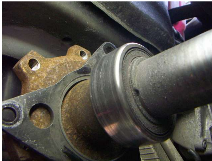
Figure 2. Grinding marks and swarf on flange housing and bearing.