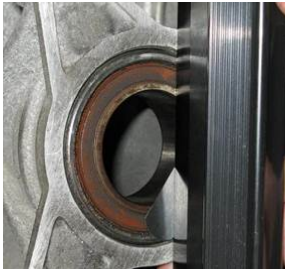
Figure 8. Determine the below flush value.