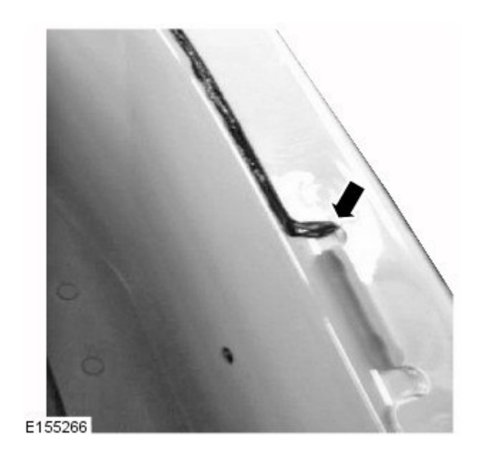
6. NOTE: The area must be clean and dry prior to applying the sealant.

Seal over the gap at the rear of the roof ditch.