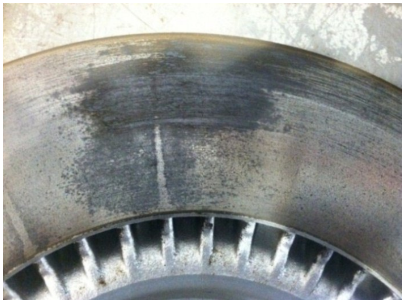
Figure 1. Brake pad marks on brake disc.