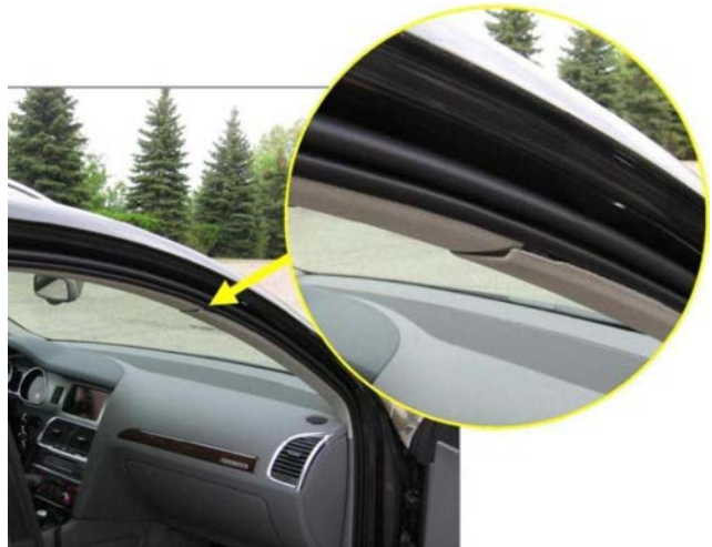
Figure 5. Loose A pillar trim.