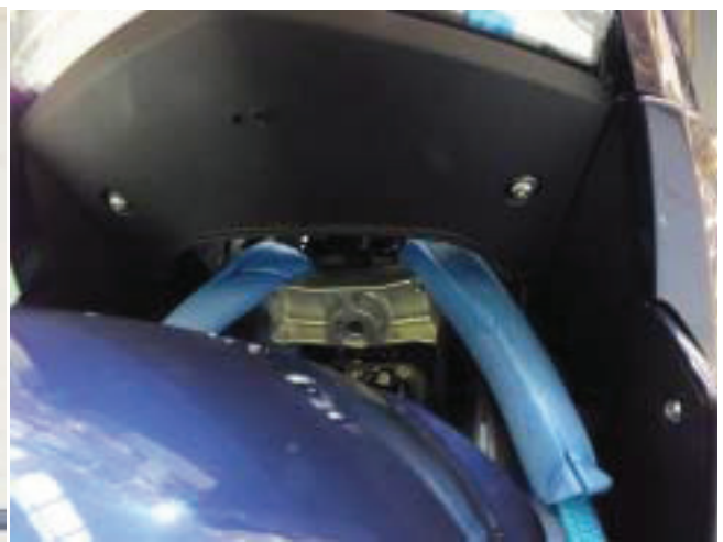
Front Ratchet Straps