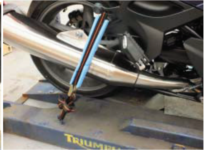
Rear Cam Straps