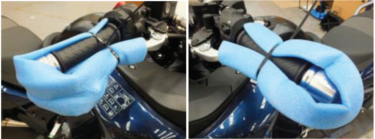
Brake/ Clutch Lever Protection