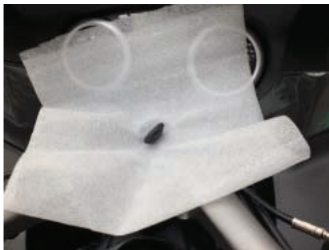
Ignition Key Protection