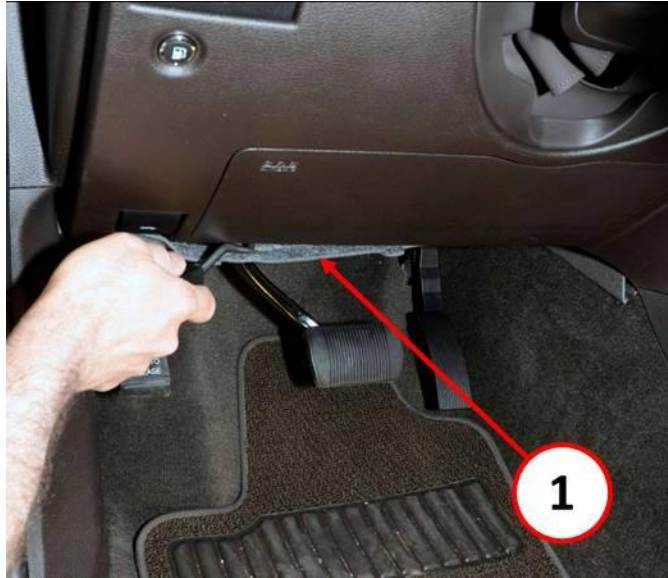
Fig. 1 Instrument Panel Closeout Removal