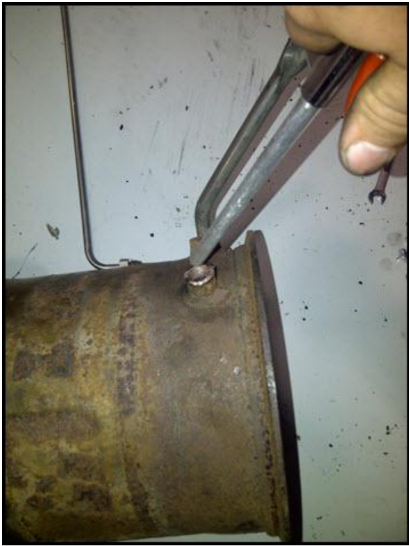
Figure 5: Blow with Compressed Air

4. Coat the threads of the new Sensor tube with a high temp (2000F) anti-seize compound ( Figure 6 ).