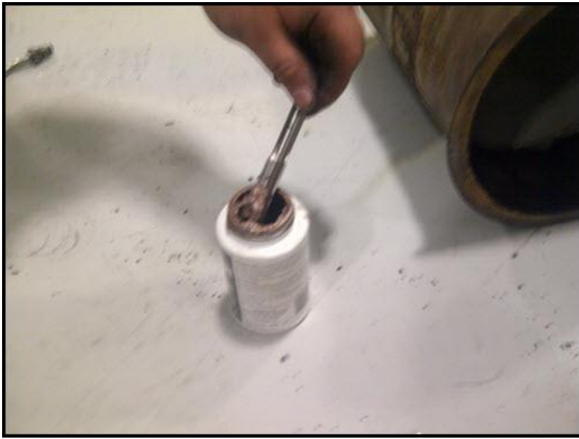
Figure 1: Coat the Flutes

2. Clean/Repair Threads using the Bottoming Tap ( Figure 2 ), not a Taper Tap ( Figure 3 ). If resistance to the Tap is felt, alternate the direction of rotation back and forth until the Tap reaches the bottom of the bung ( Figure 4 ).