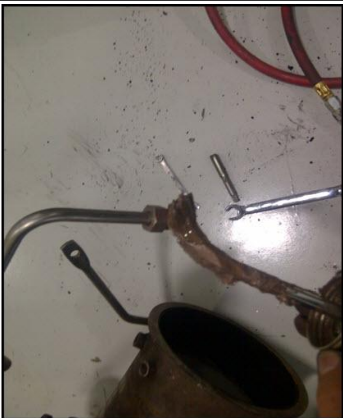
Figure 6: Coat threads of Sensor Tube

4. Coat the threads of the new Sensor tube with a high temp (2000F) anti-seize compound ( Figure 6 ).