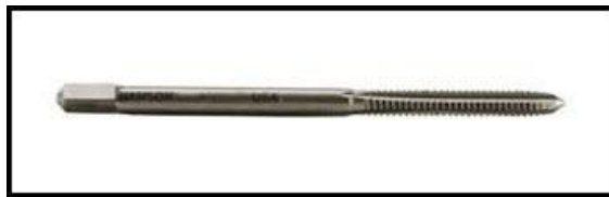
Figure 3: Taper Tap