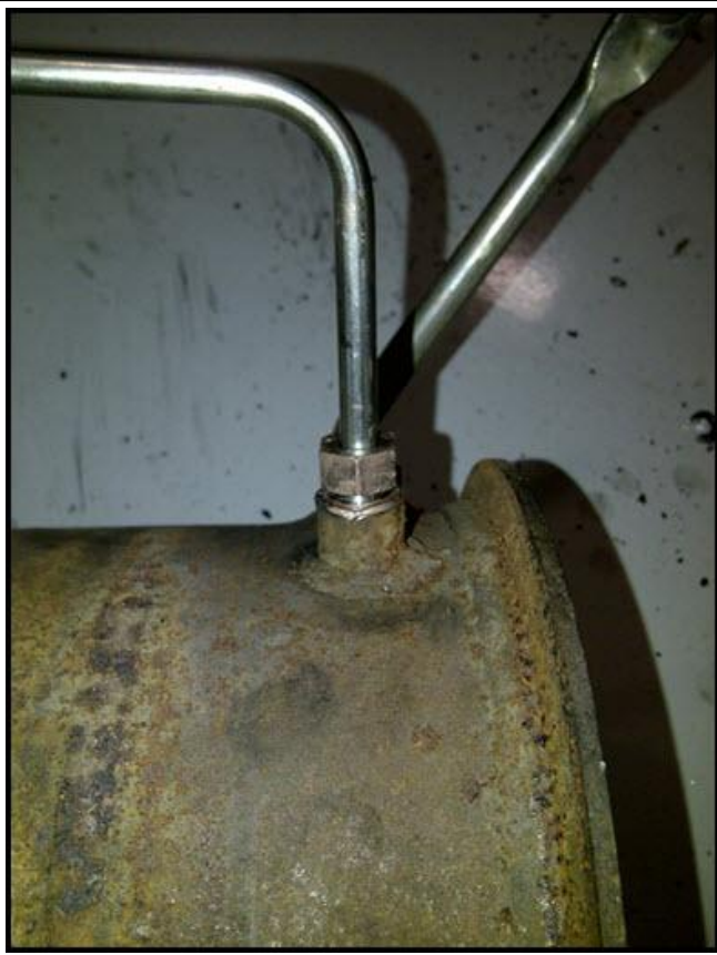
Figure 7: Completed Repair

5. Install Sensor Tube into fitting ( Figure 7 ). Torque tube to 18lbs-ft. Verify after tightening the fitting, the Sensor Tube does not turn in the fitting. If tube is still loose, remove tube and check for debris and/or repeat procedure.