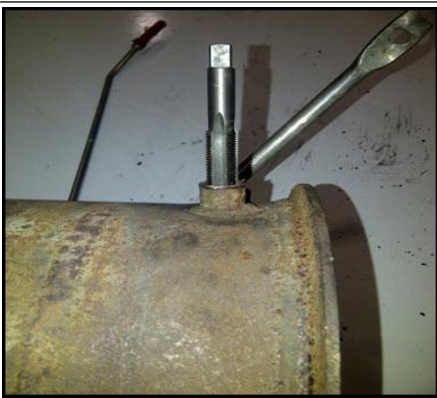
Figure 4: Tap at Bottom of Bung

3. Use compressed air to blow any loose debris from the fitting ( Figure 5 ).