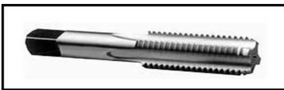
Figure 2: Bottoming Tap

2. Clean/Repair Threads using the Bottoming Tap ( Figure 2 ), not a Taper Tap ( Figure 3 ). If resistance to the Tap is felt, alternate the direction of rotation back and forth until the Tap reaches the bottom of the bung ( Figure 4 ).