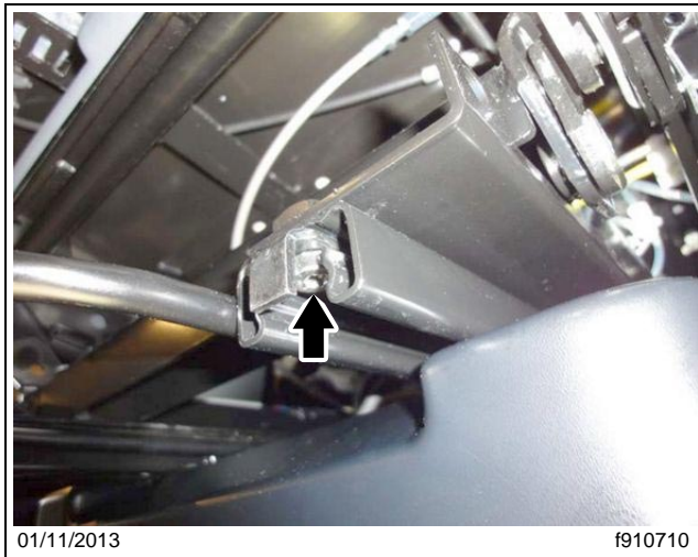
Fig. 1, Stop Bracket Mounting Screw