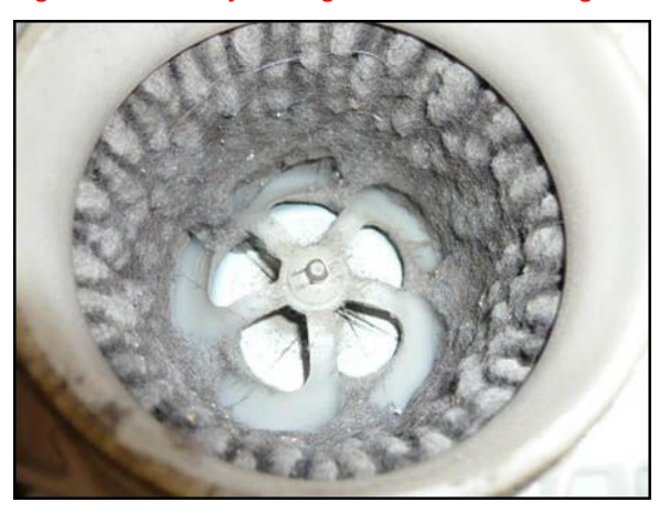
Figure 1. HV Battery Cooling Fan BEFORE Cleaning