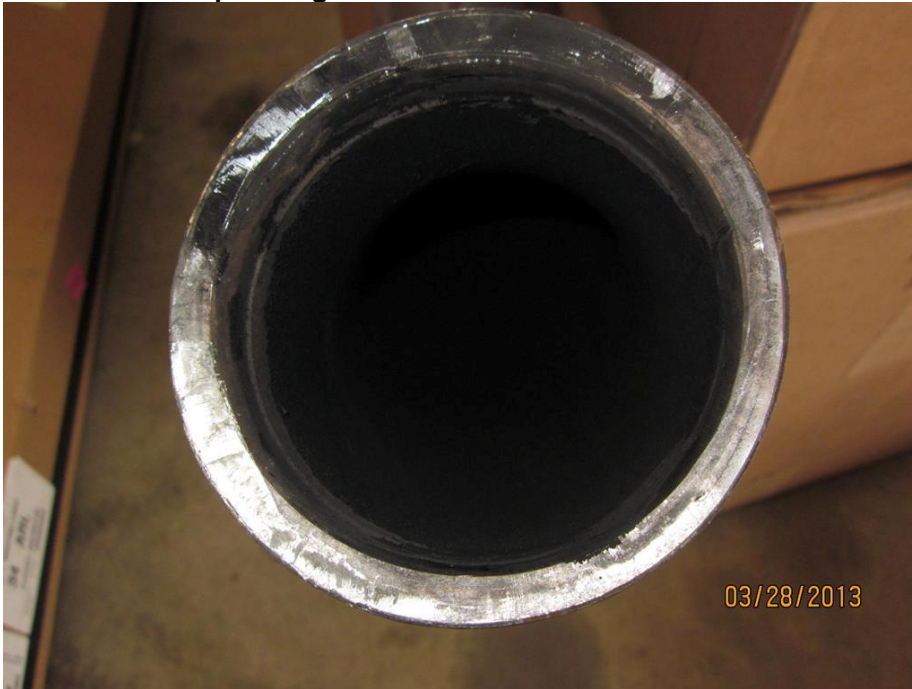
Leak at Down Pipe Flange Area