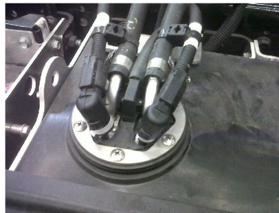
Figure 60. Diesel Exhaust Fluid (DEF) Tank Pickup Assembly