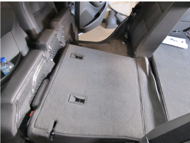
4. Press the release button in the upper seatback then fold down the seatback.