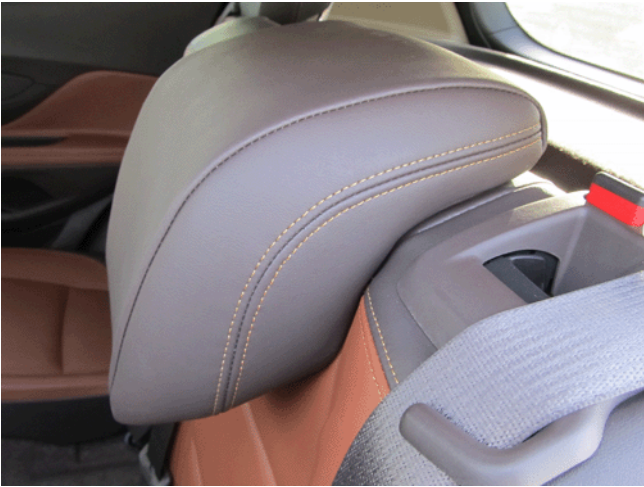
3. Fully lower the headrest.