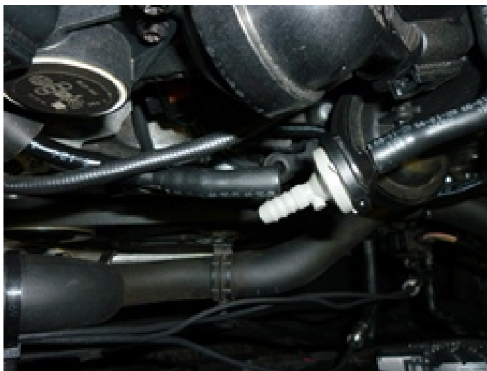
Figure 1. Vacuum check valve.

If a leak is found at the check valve, replace the valve and recheck.