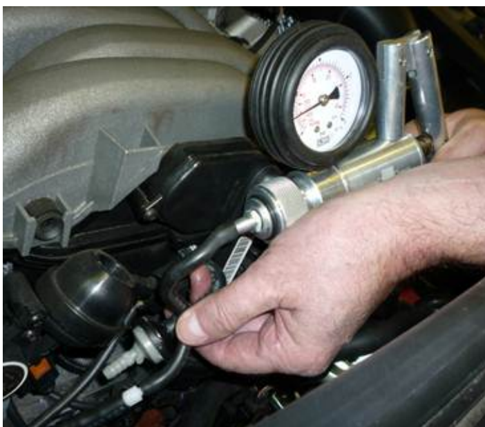
Figure 2. VAS 6213 hand vacuum pump

If the vacuum supply drops during the first 10 minutes of the test, check all pipes of the vacuum system and solenoid changeover valves for leaks. Repair as necessary.