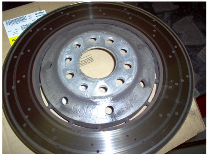
Figure 2. Grooved disc.