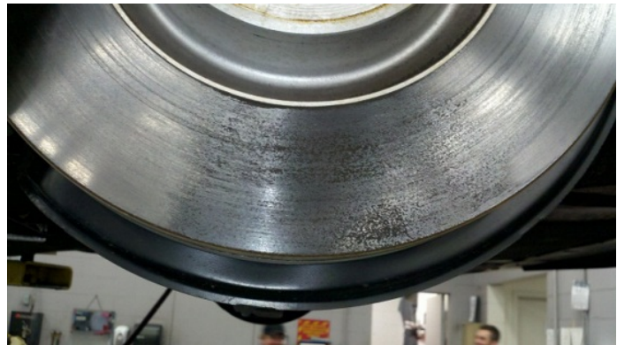
Figure 5. Brake pad material has transferred to the discs.