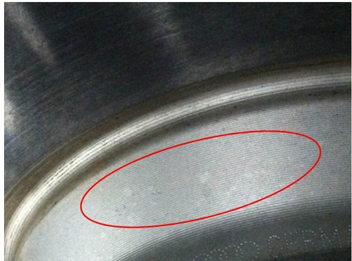
Figure 4. Small spots and discoloration due to chemical contamination from cleaner that was sprayed directly onto the disc.