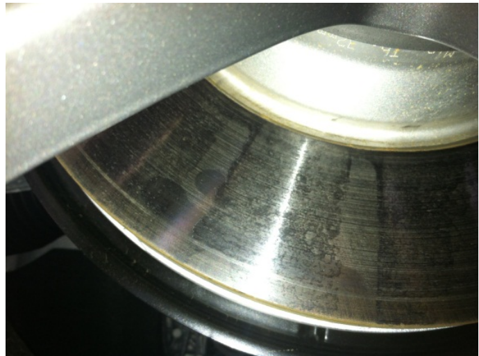
Figure 3. Discoloration on the brake disc due to chemical contamination from cleaner that was sprayed directly onto the disc.