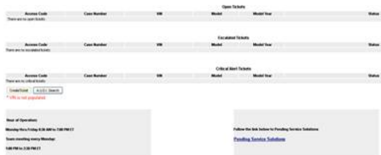
Figure 2. Technical Assistance page