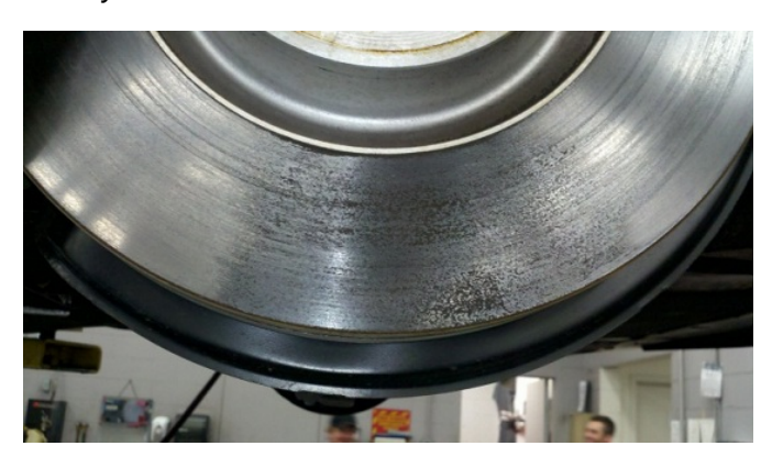
Figure 5 . Brake pad material has transferred to the discs.

7. There are "pad marks" on the brake disc as a result of brake pad material transferring to the discs (Figure 5). Pad marks can occur when a vehicle has been parked for long periods of time in a wet or snowy environment.