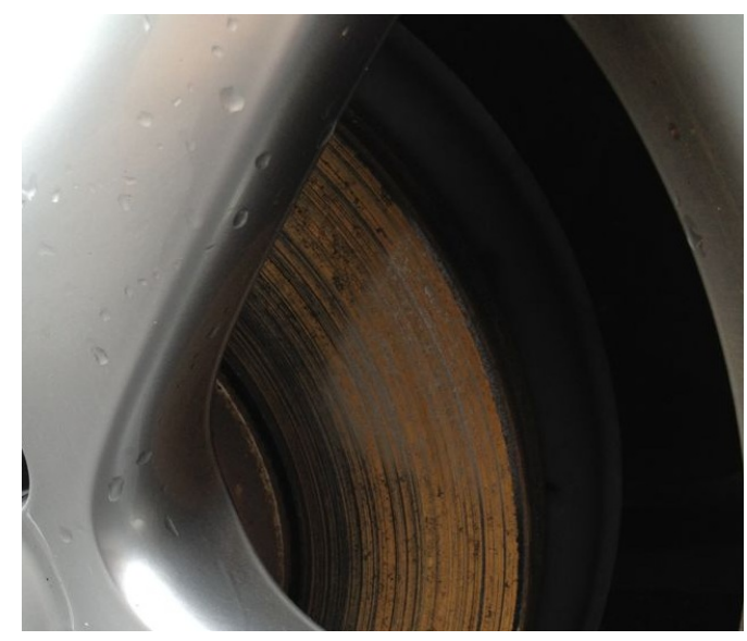
Figure 1. Disc covered with rust.