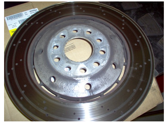
Figure 2. Grooved disc.

There is chemical contamination on the braking surface of the brake disc due to wheel or tire cleaner being sprayed directly onto the brake disc (Figure 3 and Figure 4).