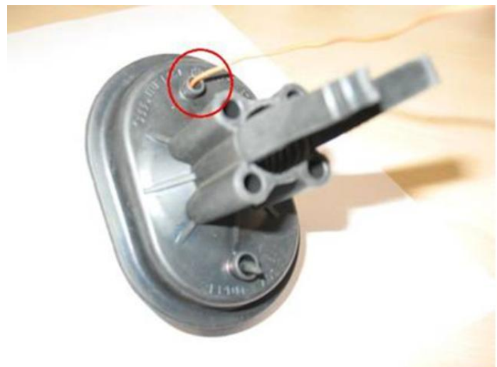
Figure 6. Access hole in grommet to be sealed with Butyl sealant.