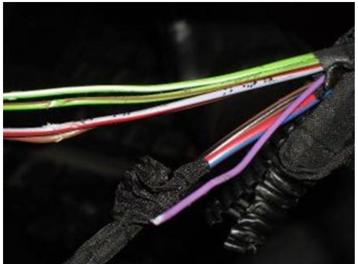
Figure 2. Wire harness under driver's side headlight.

The second known section is in the wire harness located under the driver's side headlight (Figure 2).