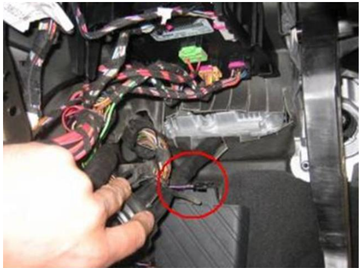
Figure 1. Wire harness in driver footwell area.

There are two known sections in the wiring harness that can be affected, but the potentially affected areas are not limited to these two known sections. One of the known sections is in the driver's footwell area where the wire harness enters the interior of the car from the engine bay (Figure 1).