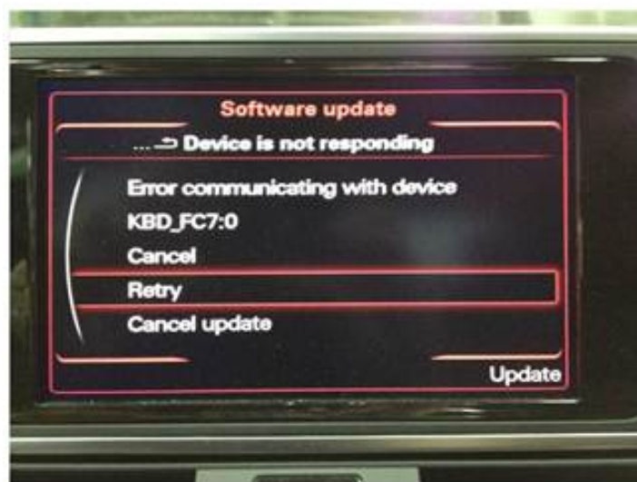
Figure 3. A device requiring a 'Cancel' selection.

Some earlier model year 2012 vehicles or vehicles equipped with Bose sound systems may experience certain modules that will not update properly during Step 16 of TSB 2028141. If this should occur, either choose 'Cancel' (Figure 3), or 'Skip device' (Figure 4), depending on the type of error. Do not choose 'Cancel update', as this may cause the software update to fail entirely. After the update is finished and the summary page is shown, select 'Retry' at the bottom of the list if it is available to attempt to update the modules again. If 'Retry' is greyed out, then the software update was successful, so select 'Continue' to proceed. In some cases 'Retry' may have to be repeated two or three times to get all modules to update successfully.