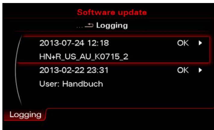
Figure 5. Software update log showing a successful software installation.