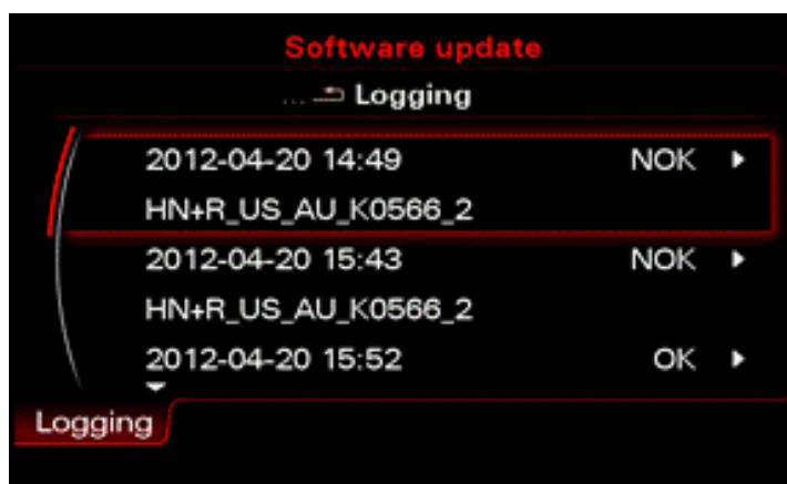
Figure 6. Software update log showing 2 failed attempts before a successful installation.

Tip: If the update must be performed two or more times due to modules not updating correctly, a screenshot of the software update log is required (Figure 6). This should be kept on-hand for warranty auditing purposes. To take a screenshot, insert an SD Card into slot 1 and press and hold the left and right arrow keys at the same time. All 4 softkeys will flash when the screenshot is taken. A screenshot should be taken of each page in the logging display.