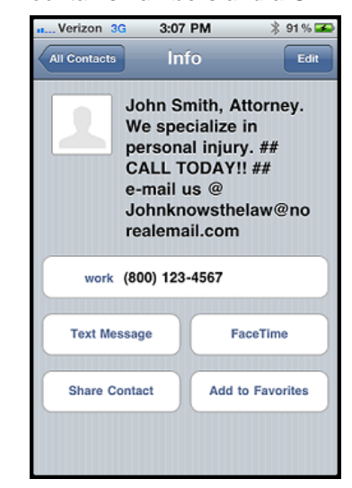
Figure 2 . Example of an incorrectly saved name field that contains incorrect characters.