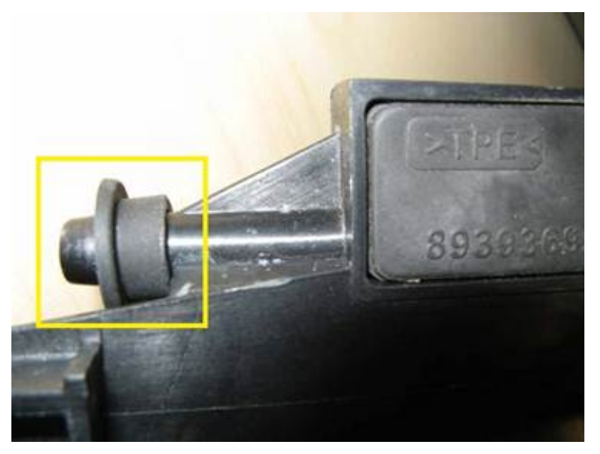
Figure 5. Ring seal installed on headlamp air tube.

Install ring seal on headlamp air ventilation tube (Figure 5). The larger diameter of the seal faces the headlamp.