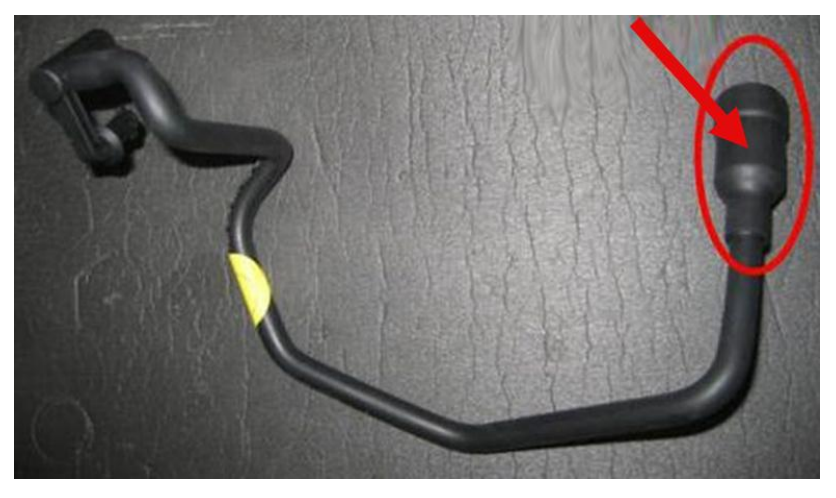
Figure 2. Updated ventilation hose with integrated filter.

Tip: The updated ventilation hose can be recognized by the integrated filter (Figure 2, arrow).