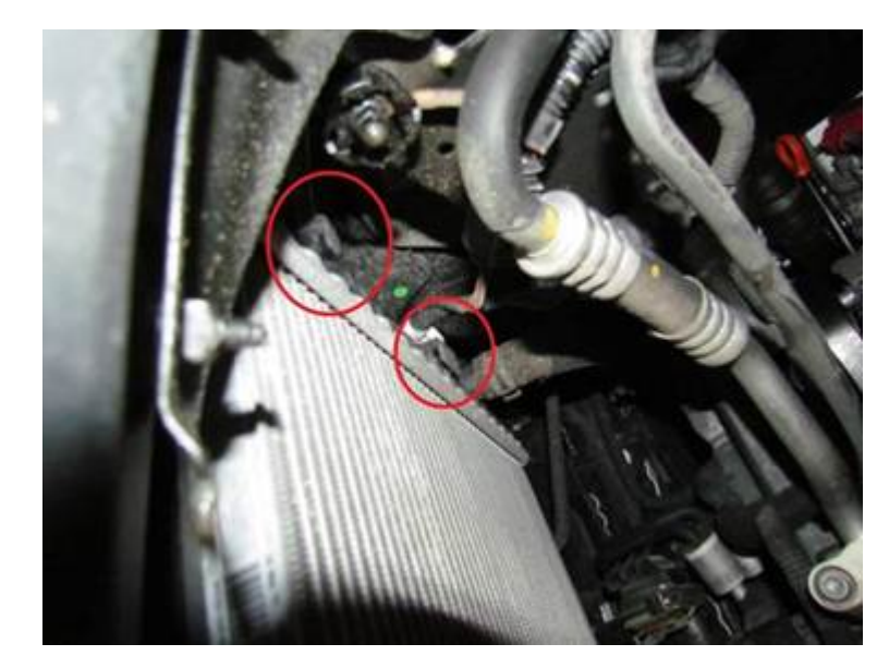
Figure 8. Upper exit air duct attachment points to charge a cooler.