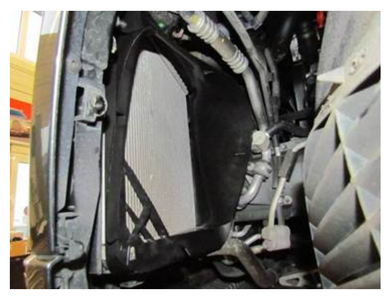
Figure 9. Charge air cooler exit air duct installed.

Affix left and right exit air ducts over the rear of the charge air coolers (Figure 9).