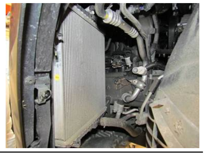
Page 5 of 9

© 2013 Audi of America, Inc. All rights reserved. Information contained in this document is based on the latest information available at the time of printing and is subject to the copyright and other intellectual property rights of Audi of America, Inc., its affiliated companies and its licensors. All rights are reserved to make changes at any time without notice. No part of this document may be reproduced, stored in a retrieval system, or transmitted in any form or by any means, electronic, mechanical, photocopying, recording, or otherwise, nor may these materials be modified or reposted to other sites, without the prior expressed written permission of the publisher.