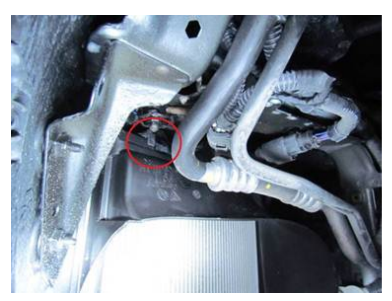
Figure 10. View of exit air duct affixed to mounting hook.

Inspect exit air duct attachment points to be sure that ducts are engaged properly over charge air cooler hooks (Figure 10).