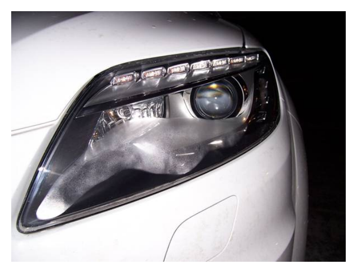
Figure 1. Moisture in headlamp.