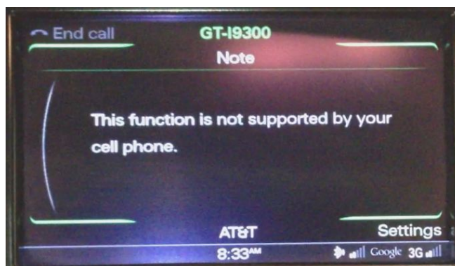
Figure 1. Error message on MMI display.

The customer complains that when he or she is trying to place a phone call from the vehicle while using a Bluetooth®-connected phone, the phone call disconnects before it begins and an error shows on the MMI display. The message may be "Function not supported" (Figure 1) or "Network error".