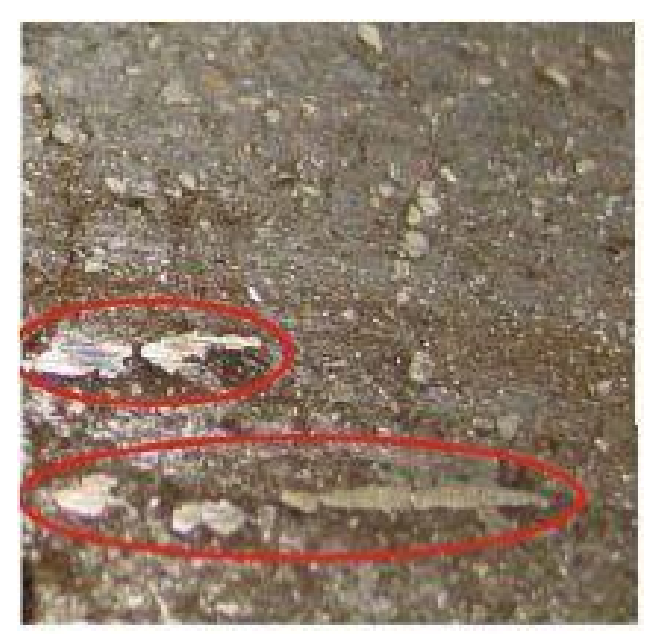
Figure 1. Metallic deposits.