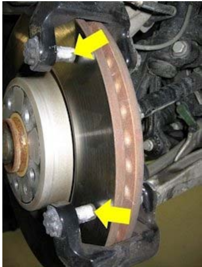
Figure 5. Caliper carrier guide pins with anti-seize lubricant applied where the pads make contact.

2. Apply a thin coat of anti-seize lubricant ( G 052560A2 ) to the guide pins of the caliper carrier prior to installing the brake pads (Figure 5). Only apply the lubricant to the section of the guide pins that will be contacted by the brake pads.