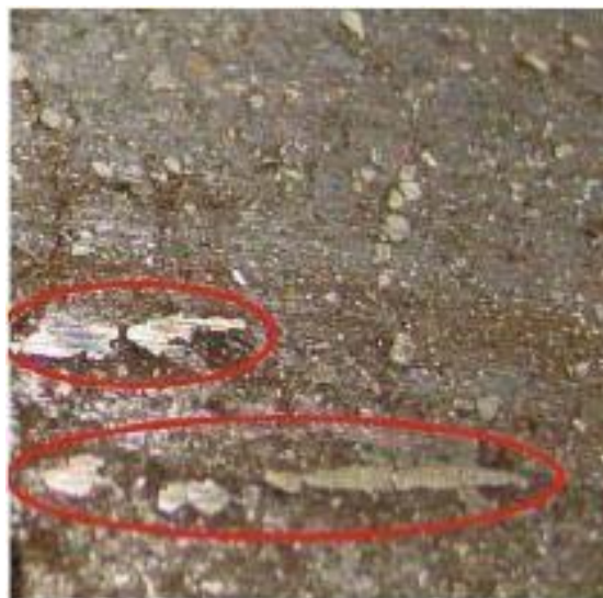
Figure 1. Metallic deposits.