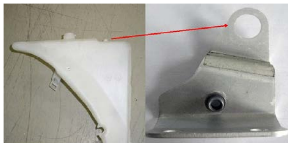
Figure 1. Area of contact between the mounting bracket for the windshield washer reservoir and the washer reservoir.

Excessive free play between the mounting bracket for the windshield washer reservoir and the washer reservoir.