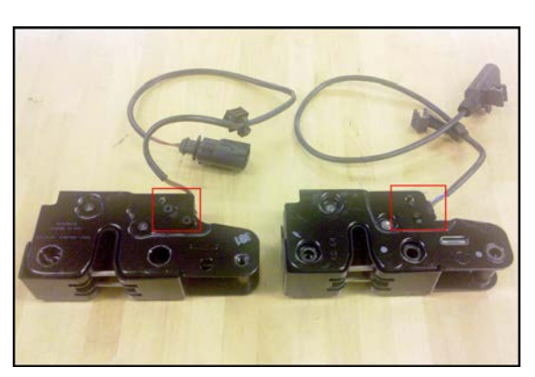
Figure 3. The mounting locations for the contact switches are different; thus, they are not cross compatible.

• If the value in the MVB changes as expected (normal operation of the contact switch), then the vehicle may have an oil level issue. Please check the oil according to the instructions in the Repair Manual.