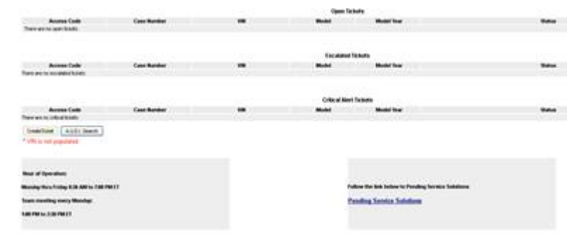
Figure 2. Technical Assistance page