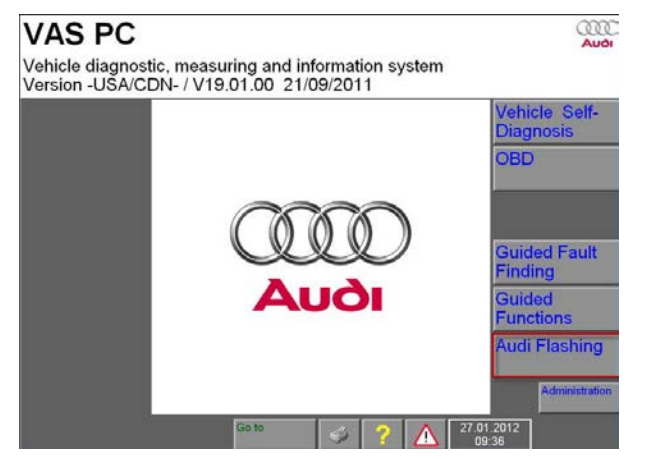
Figure 2. Audi Flashing.

Tip: If you do not have the latest Base/Brand CD installed on the tester, then the SVM code may fail and return an "ASM-MCD base system error" because the tester is not capable of reading the software flash file. Starting with the model year 2010, some software files have changed and cannot be read with base tester software level 15 or lower. Level 16 or higher must be installed on the tester along with all released patches found on ServiceNet. VAS Tester Patches can be found using — www.AccessAudi.com >> Special Tools and Equipment >> VAS Tester Information >> Software.