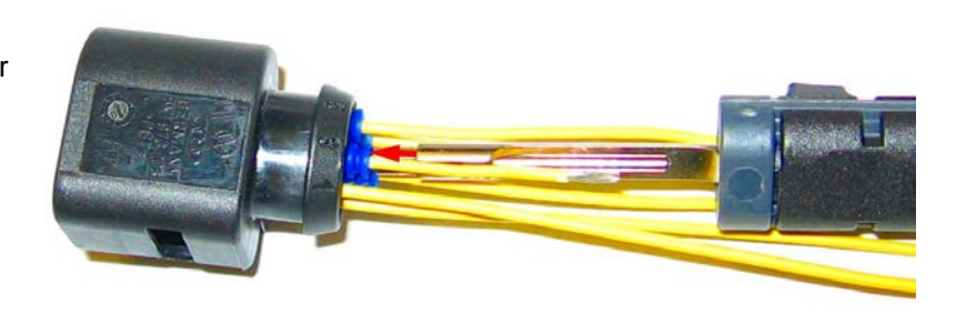
Figure 3. The single wire seal, slid as far as the stop.