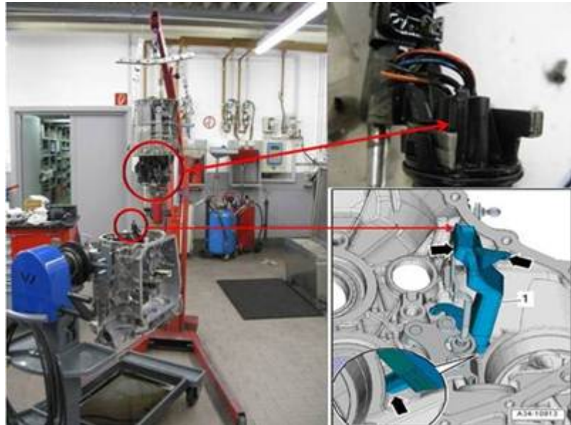
Figure 7. Caution points: drip tray Sensor module connector.

Tip: Use caution when lifting or lowering intermediate housing to avoid damage to components (Figure 7).