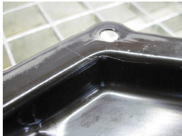
Figure 2. Crack in the oil pan.