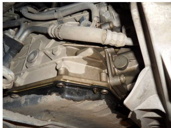
Figure 3. Leak between gearbox housing and intermediate housing.

Tip: The source of the leak may be confused with o-ring of drain plug.