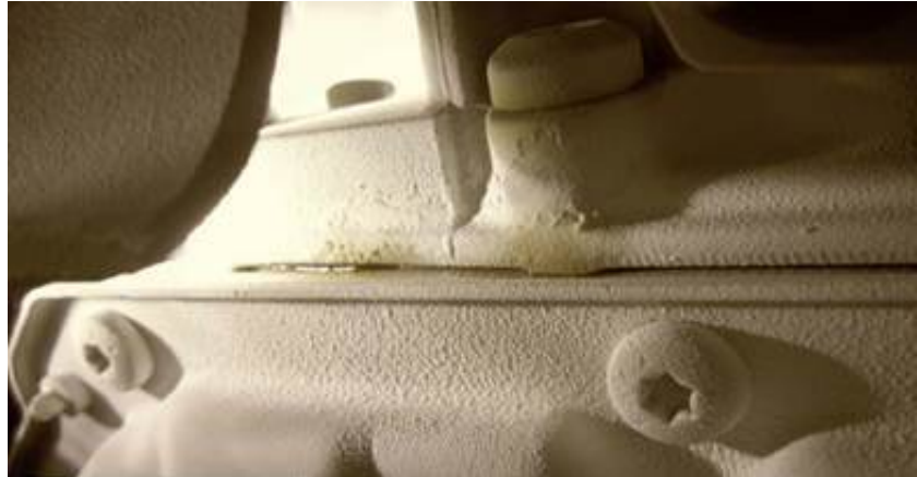
Figure 4. Leak located with Talcum spray.