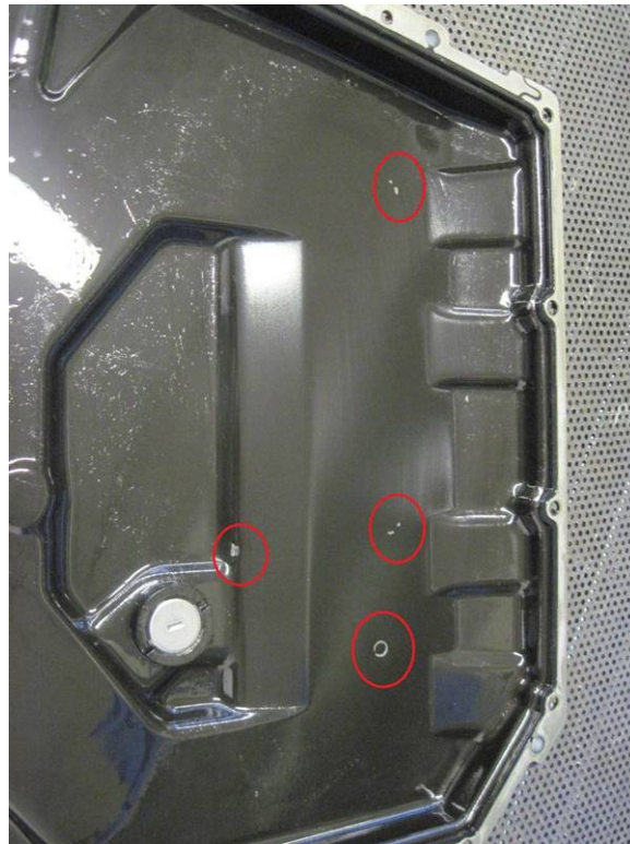
Figure 5. Damaged oil sump because of loose bolts.