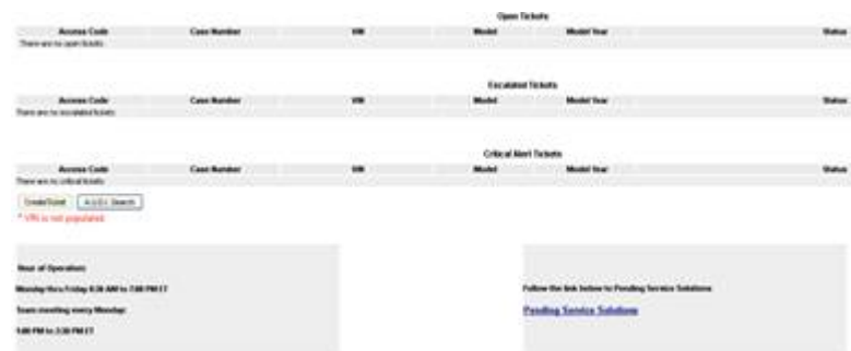
Figure 2. Technical Assistance page