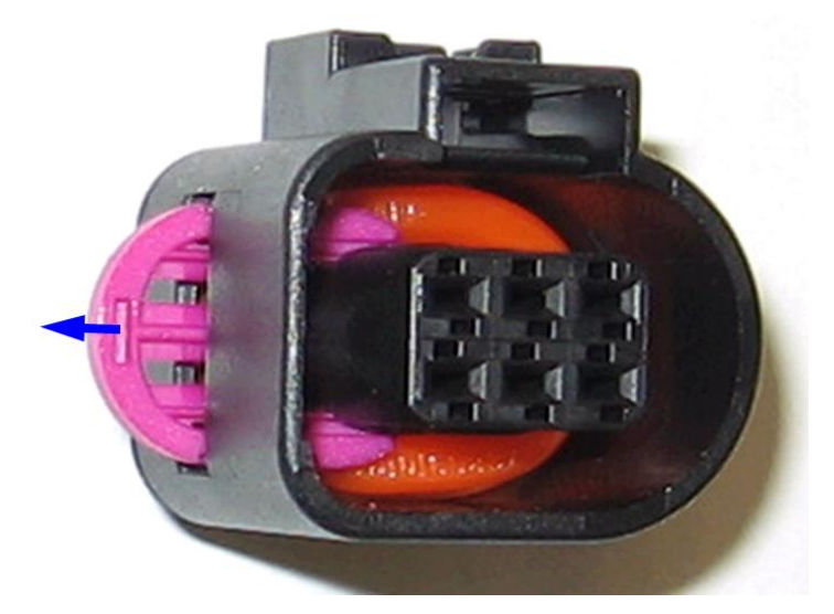
Figure 2. The slot to be used to remove the pink lock.

4. On the new housing, remove pink lock with small flathead screwdriver, using the slot on the pink lock (Figure 2).