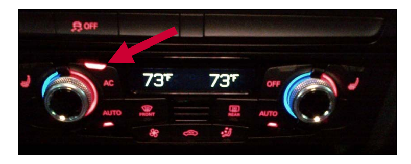
Figure 1: Climate control with A/C LED on

A: You can use other settings for climate control as long as the LED for A/C is illuminated ( Figure 1 ).