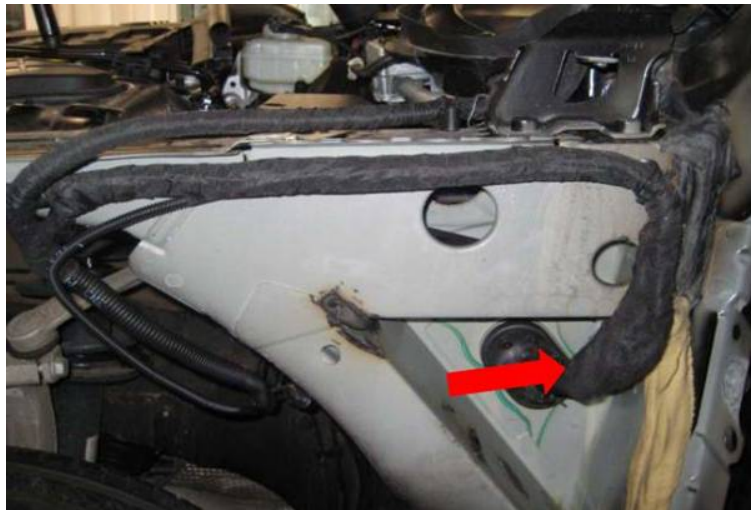
Figure 1. Left front fender is removed to show the left bulkhead grommet

The insulation for the ABS wheel speed sensor is damaged in production. Over time, this can lead to corrosion on the wires and restricted functions with the ABS control module. Only the wires in the left bulkhead grommet (Figure 1) are affected.