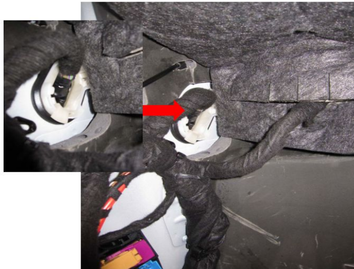
Figure 4. Grommet position photo, taken from inside the passenger compartment.