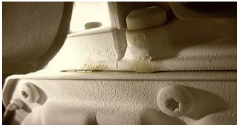
Figure 4. Leak located with Talcum spray.