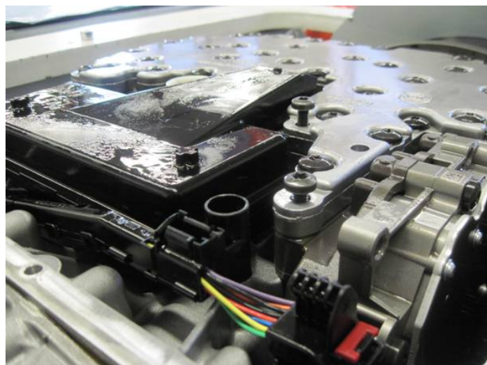
Figure 6. Loose bolts in the mechatronics.