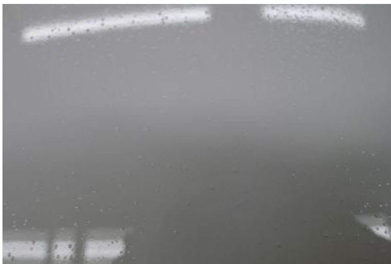
Figure 1. Paint blistering condition.

The painted surface of certain carbon composite constructed exterior body panels exhibit a 'blistering' condition (Figure 1).