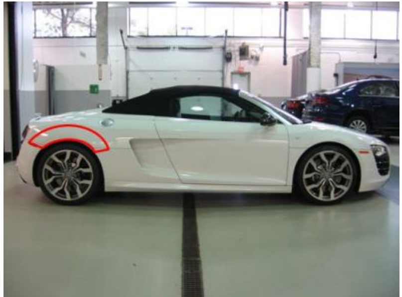
Figure 3. Area of right rear quarter panel affected.