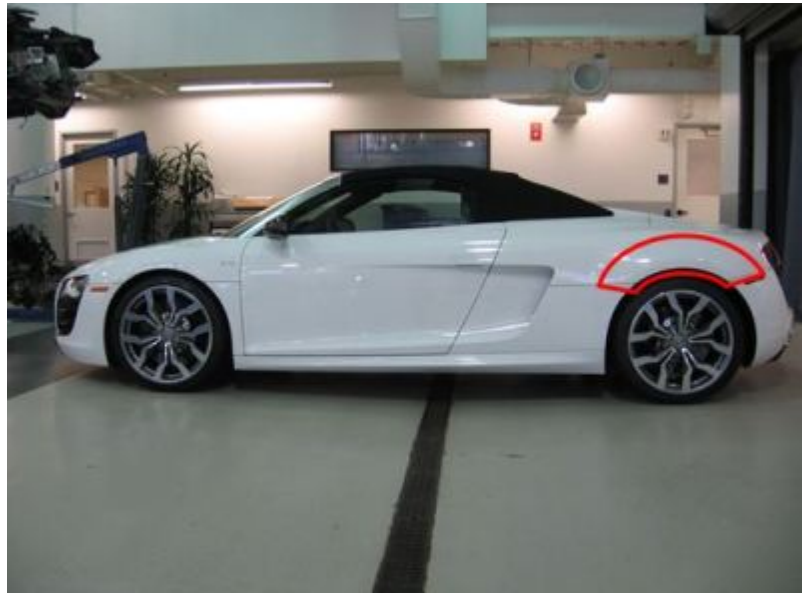
Figure 4. Area of left rear quarter panel affected.